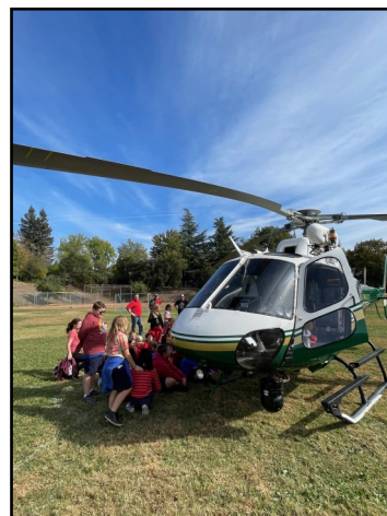
Students see a helicopter up close on First Responders Day and dress in neon for "Our Future is Bright and Drug Free" during Red Ribbon Week!