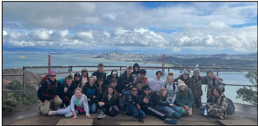
The 7th grade class enjoys a view of San Francisco and the Golden Gate Bridge from the top of Hawk Hill on their overnight trip to the Marin Headlands.

SJSC 3rd and 4th graders experimented with shapes such as triangles and arches to determine which can best support a load without collapsing. They then worked in teams building a bridge with index cards that will support a toy car