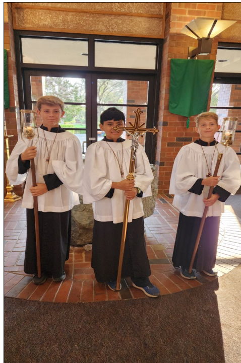
Student Alter Servers at our weekly all-school Mass.

We are thrilled that our students are enjoying our new religion curriculum— Finding God by Loyola Press. Finding God is a multigrade program which focuses on discipleship and is rooted in Scripture, teachings of the Catholic Church, and the rich tradition of the spirituality of Saint Ignatius. This modern curriculum meets our students’ needs through engaging activities that help them find God in their daily lives.