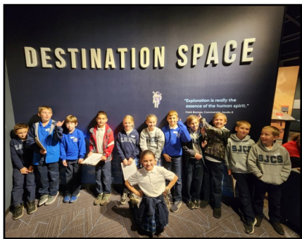
The 4th grade class at the SMUD Museum of Science and Curiosity.