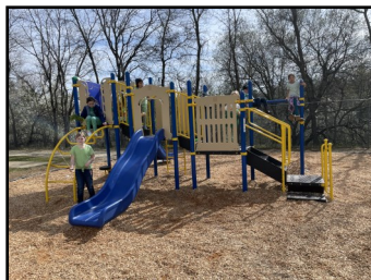
Students enjoy the new playground structure funded by the generosity of supporters at last year's Gala.