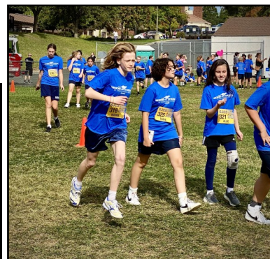
Our annual Jog-A-Thon is the students' favorite fundraiser!