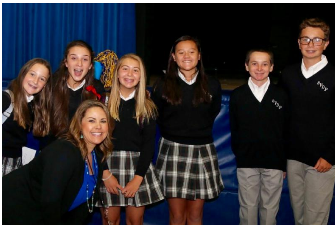
Members of the SVDP Student Council prepare for morning assembly.