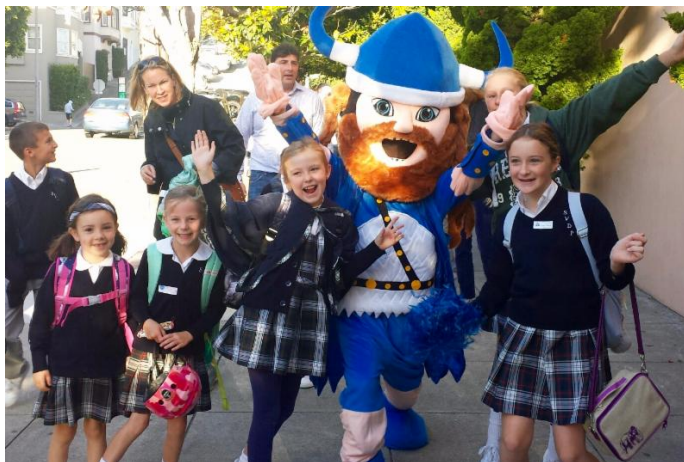
Vinnie welcomes the children on our first Walk and Roll Friday.

SVDP welcomes our new mascot, Vinnie the Viking.