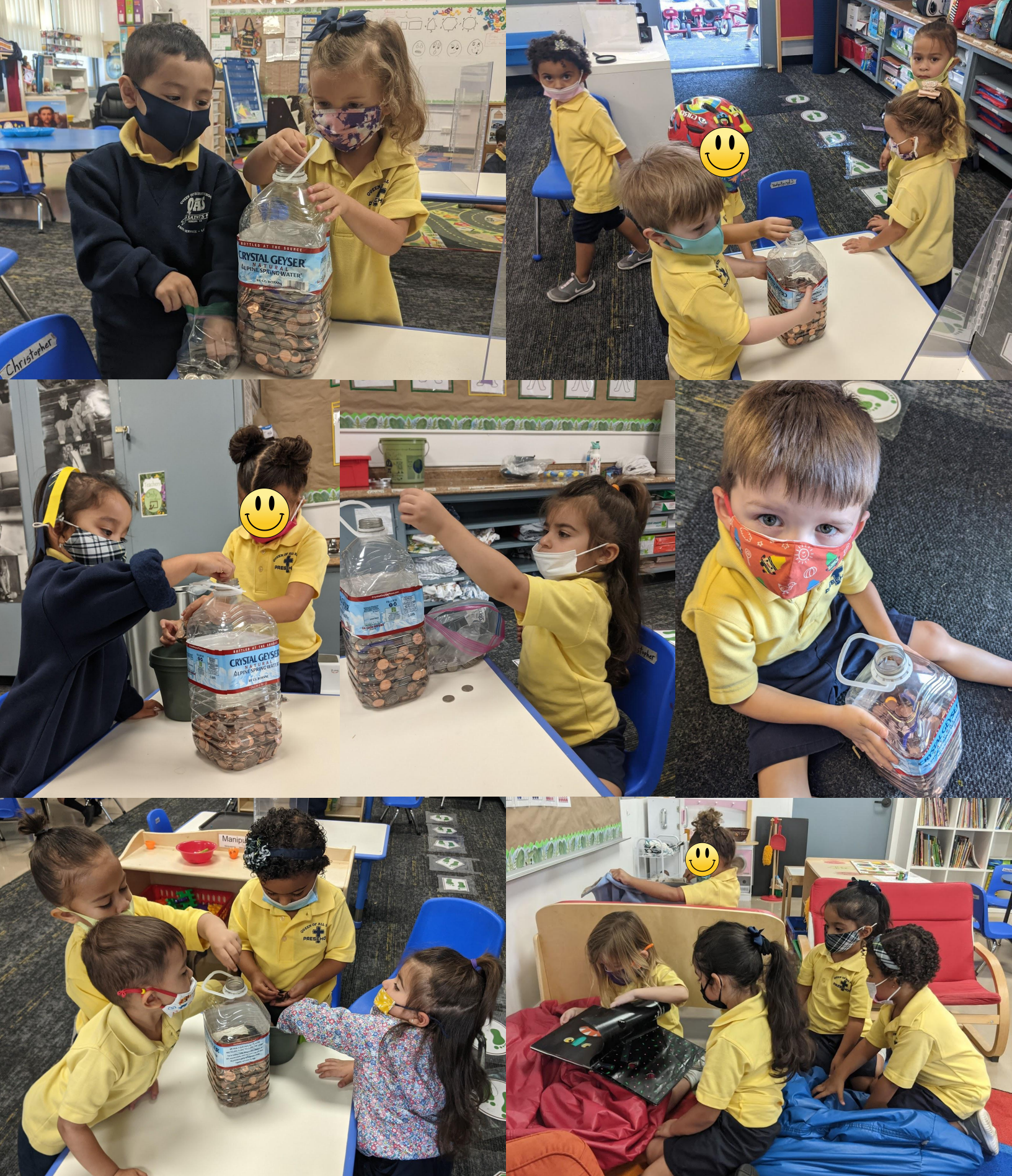
Photos may not be posted publicly without prior approval from Queen of All Saints School.