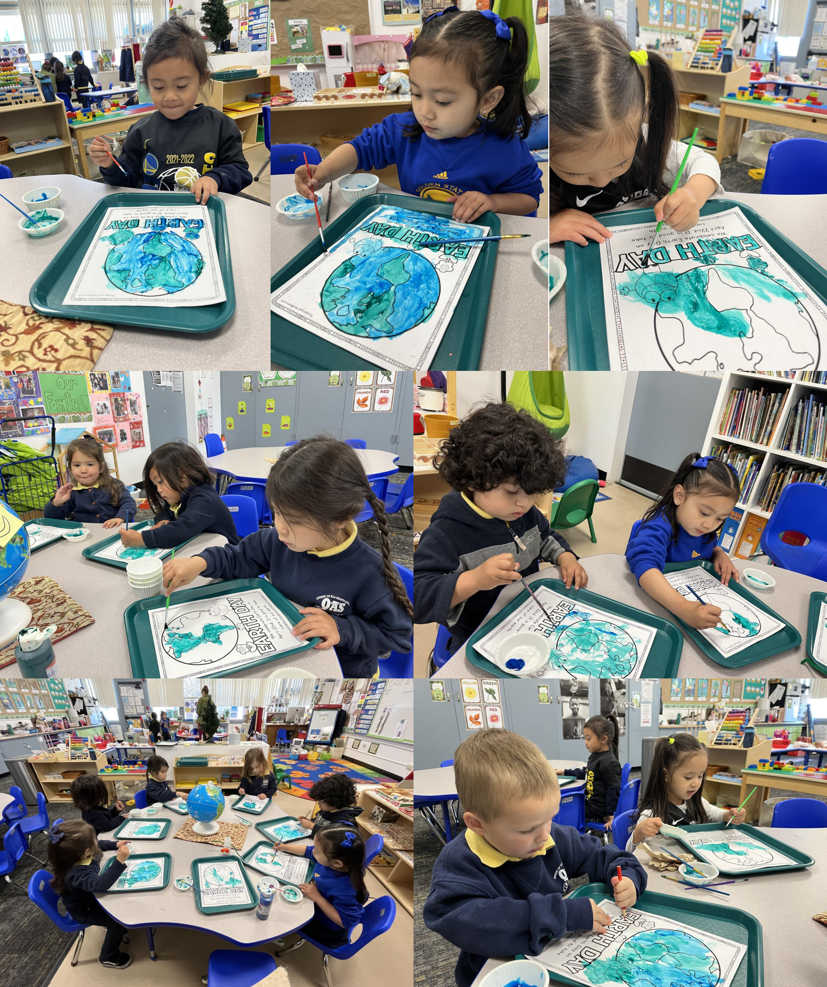
Photos may not be posted publicly without express permission from Queen of All Saints School