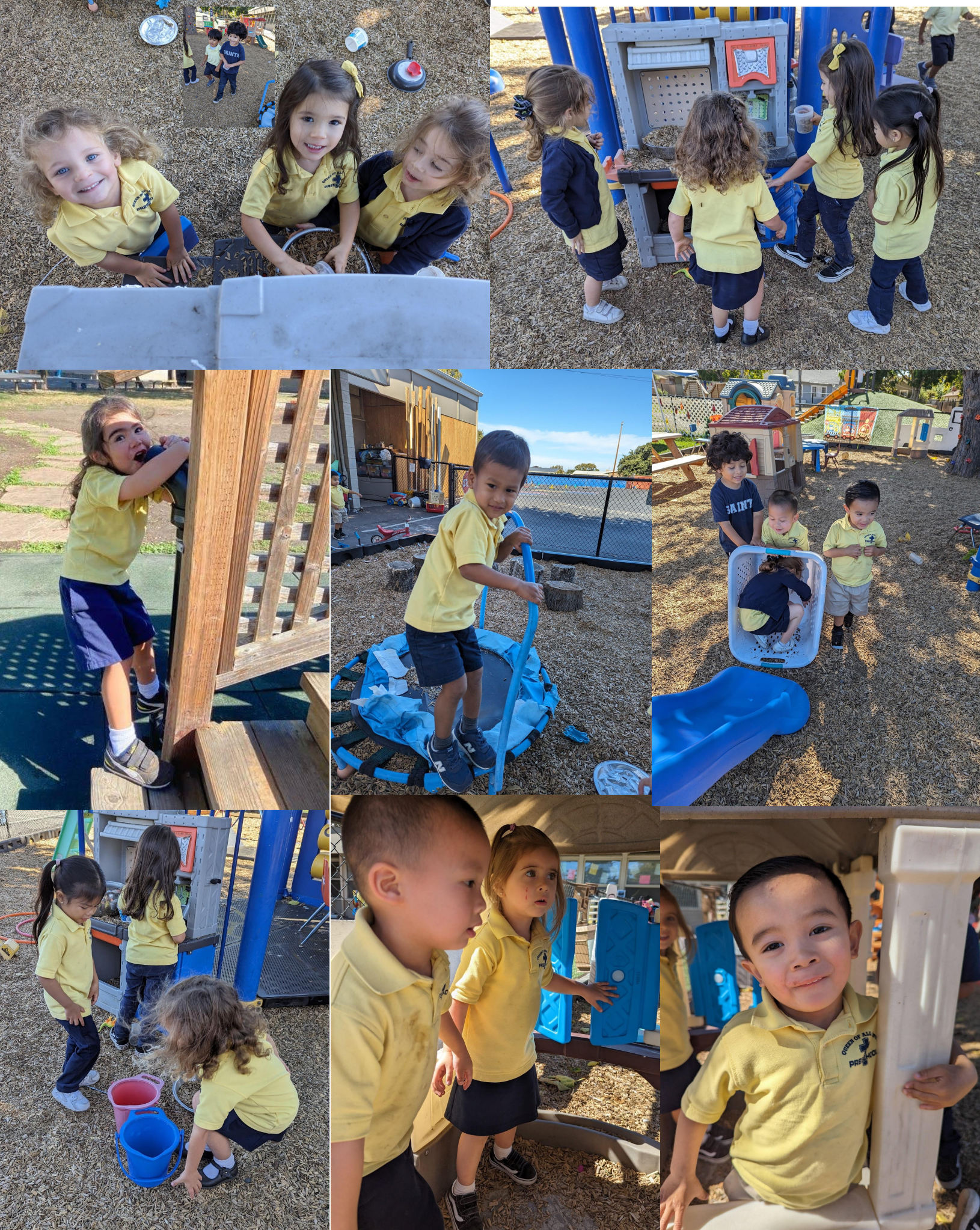
Photos may not be posted publicly without express permission from Queen of All Saints School