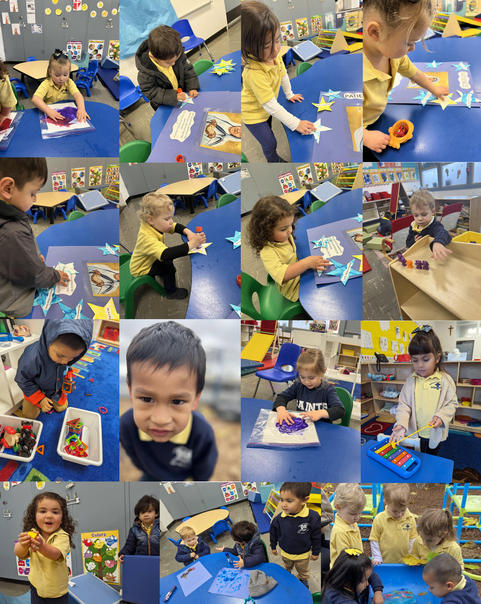
Photos may not be posted publicly without express permission from Queen of All Saints School