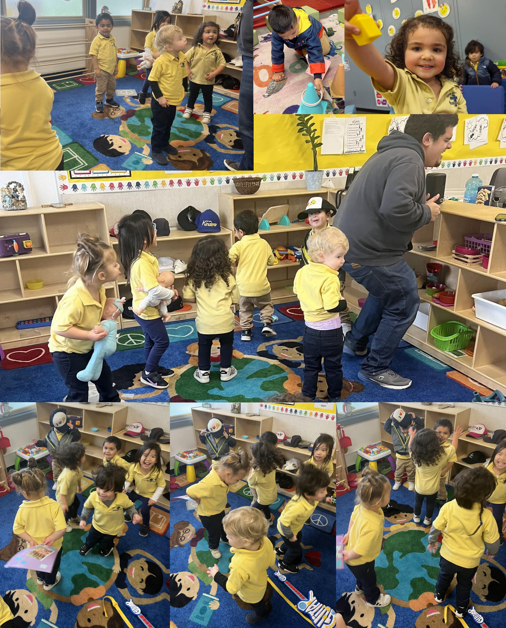
Photos may not be posted publicly without express permission from Queen of All Saints School