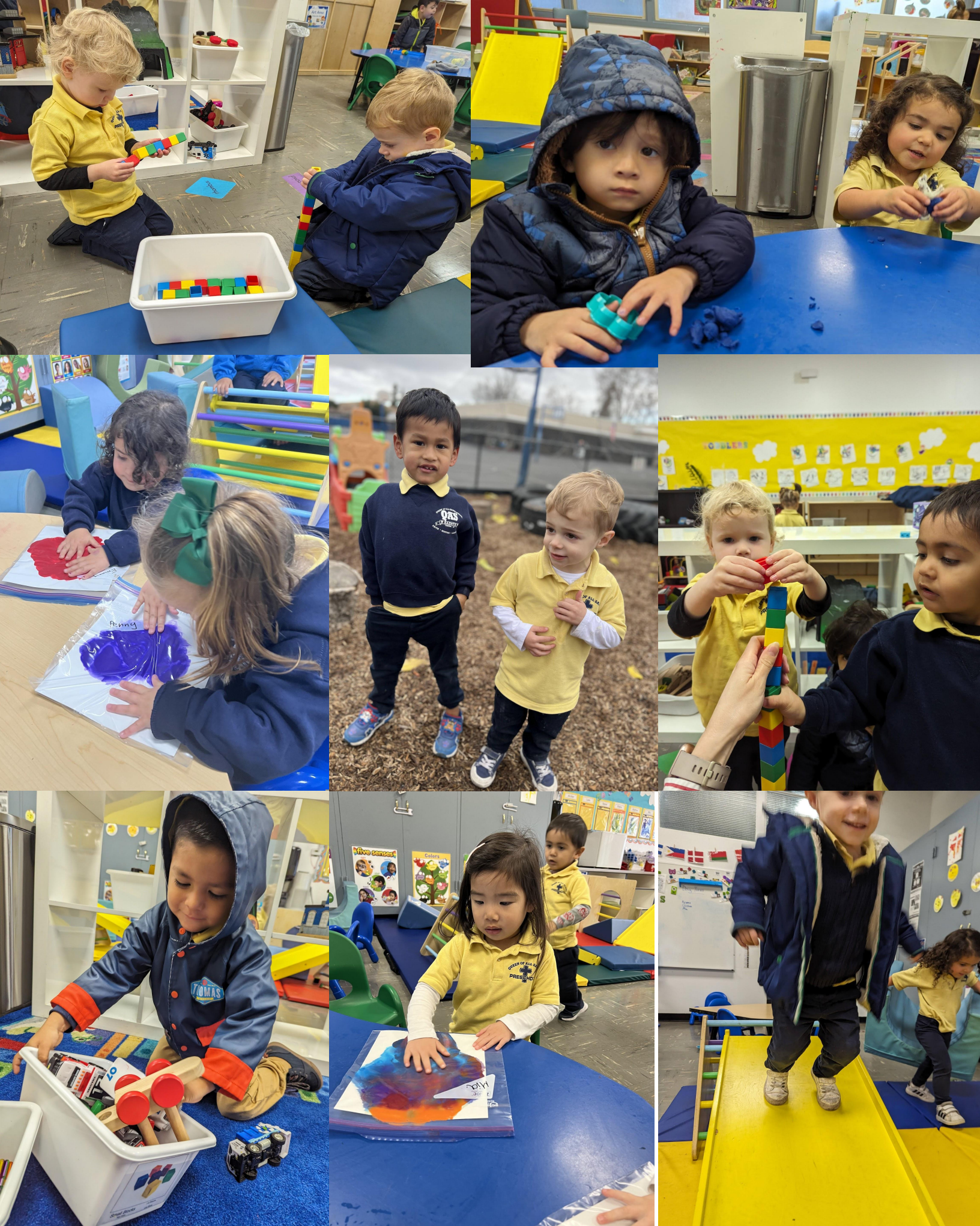
Photos may not be posted publicly without express permission from Queen of All Saints School