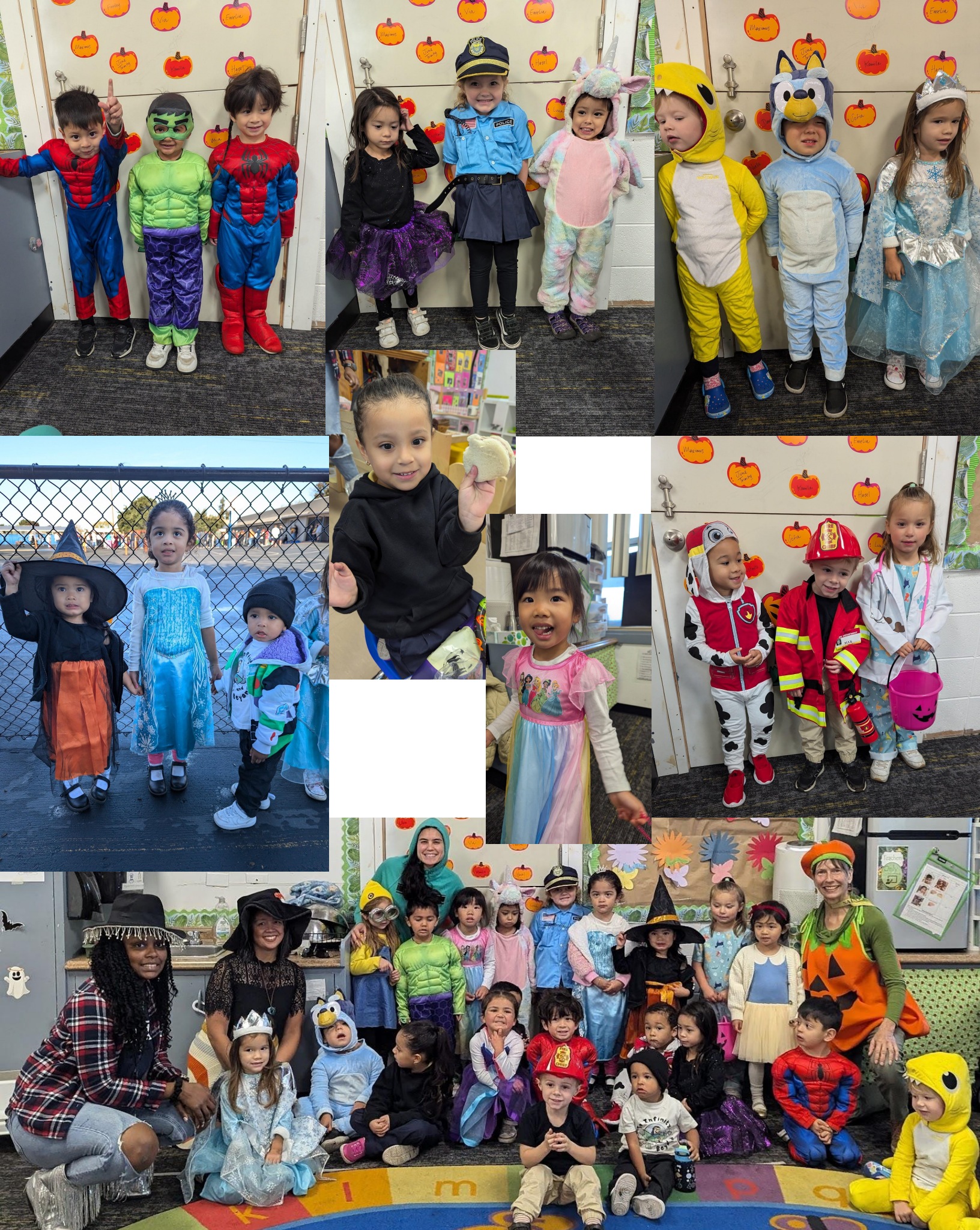
Photos may not be posted publicly without express permission from Queen of All Saints School