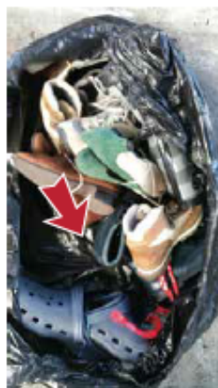
• Not rubber banded or tied