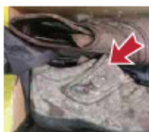
• No moldy shoes