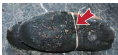
• Soles are melted, distorted and not wearable