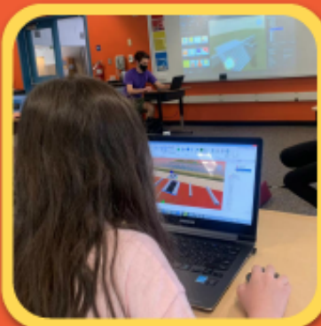
ROBLOX GAME DESIGN