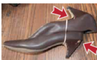
• Heel is broken and too worn to be usable