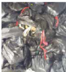
• No black unapproved bags