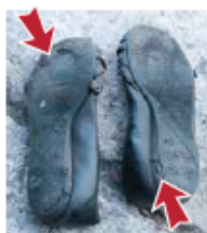
• Soles are too worn and not wearable