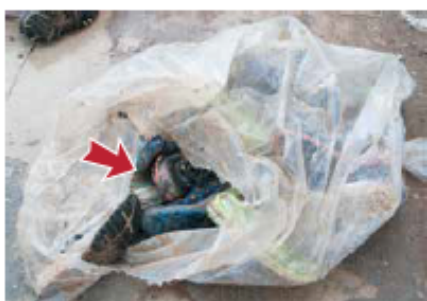
• No wet shoes