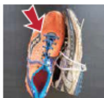
• Mismatched pair