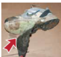
• Sole is falling off. Not in wearable condition

If you have any questions or are unsure about the quality of collected shoes, please connect with your fundraising coaching team.