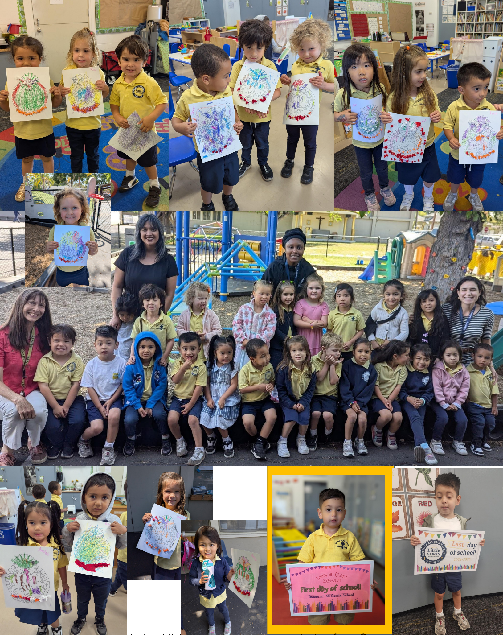
Photos may not be posted publicly without express permission from Queen of All Saints School