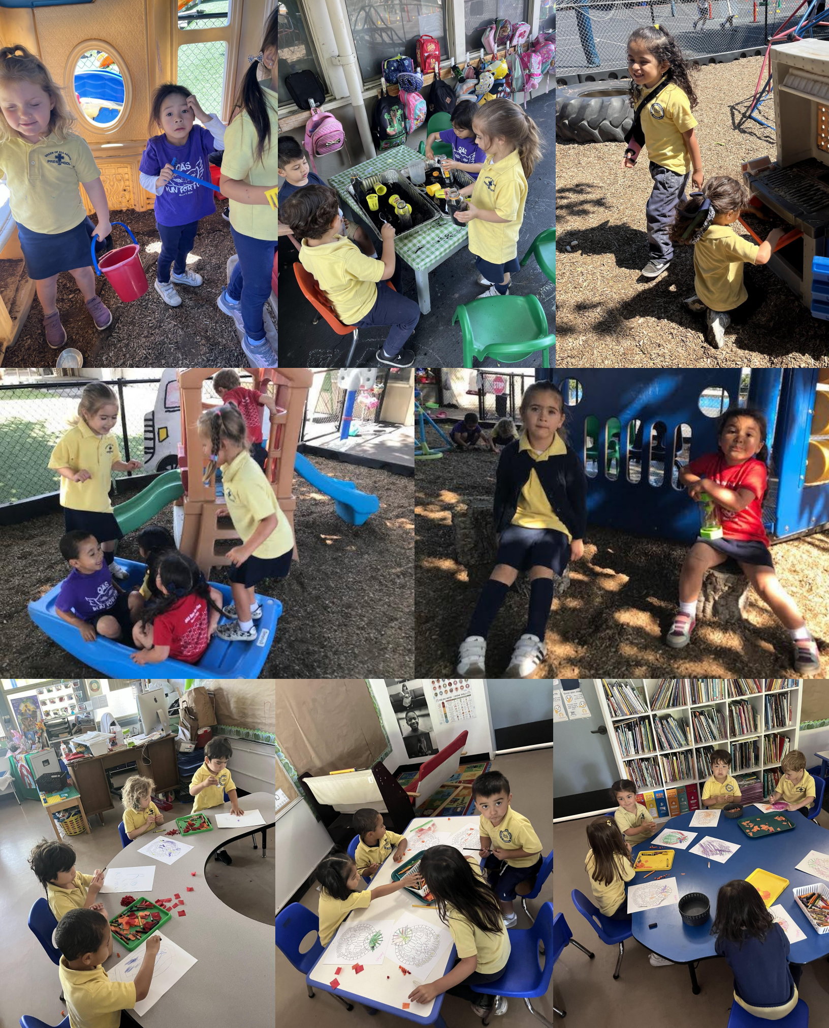
Photos may not be posted publicly without express permission from Queen of All Saints School