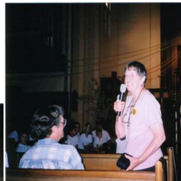
The Sisters share their memories

including tutoring students in math before school each day."