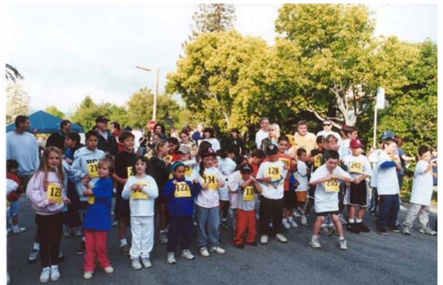
Students at the start of the first Mount Carmel Fun Run