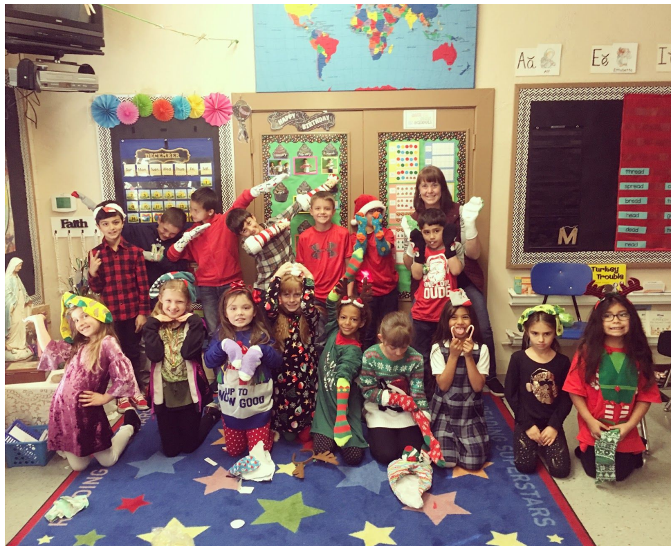
Fun times in Second Grade!