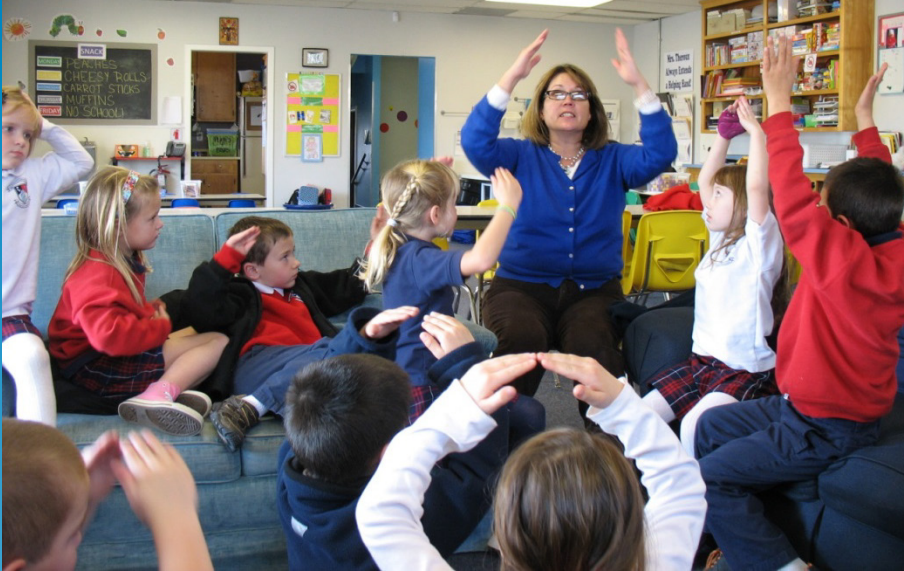
Learning Sign Language