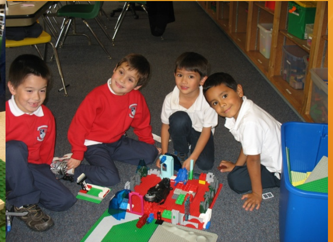
Building with Legos