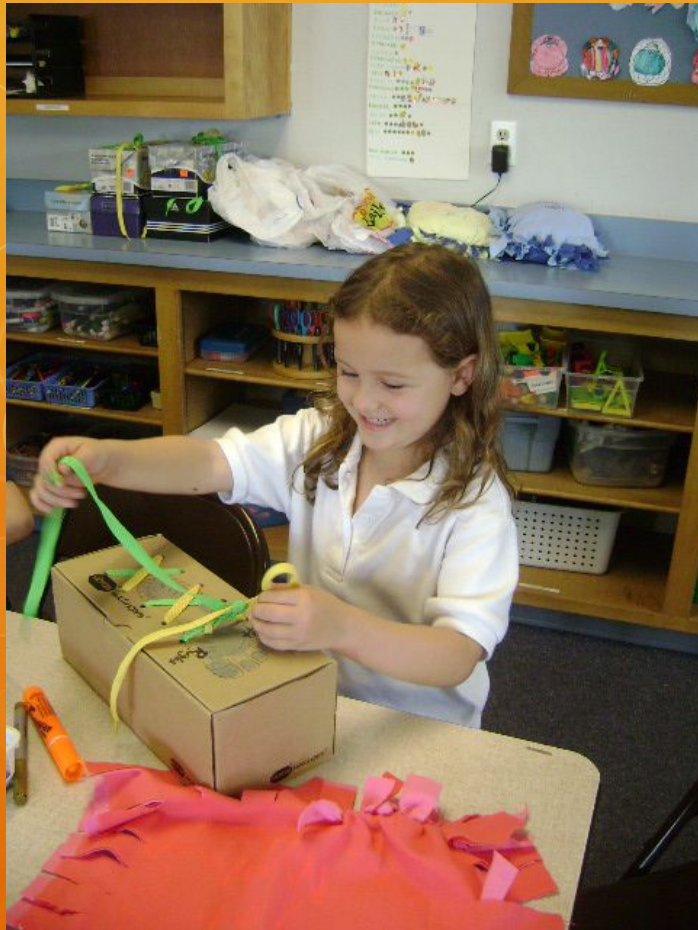
Learning to tie shoes