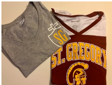
Women's ts: grey, maroon