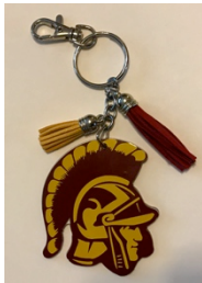
Keychain/ backpack tag