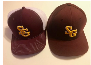
Baseball cap maroon (fitted) or trucker (adjustable)